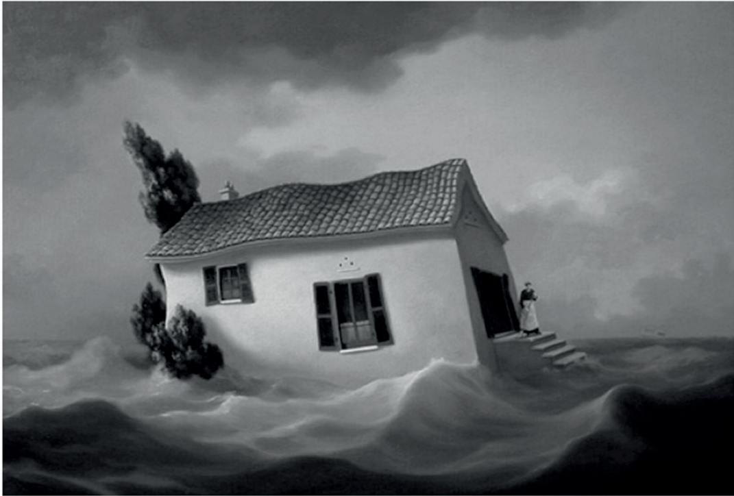
Samy CHARNINE, (French artist born in 1967, migrated to the USA in 1983) Homesick , 2008 Oil on canvas, 70cm x 52cm