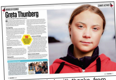
Article adapted, with thanks, from The Week Junior News