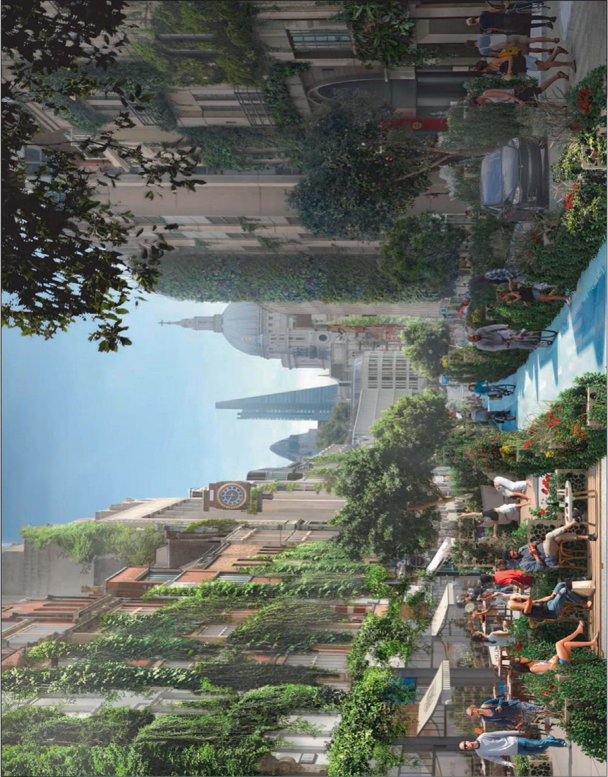
Wimberly, Allison, Tong & Go, www.watg.com (architectural firm), 10 October 2017