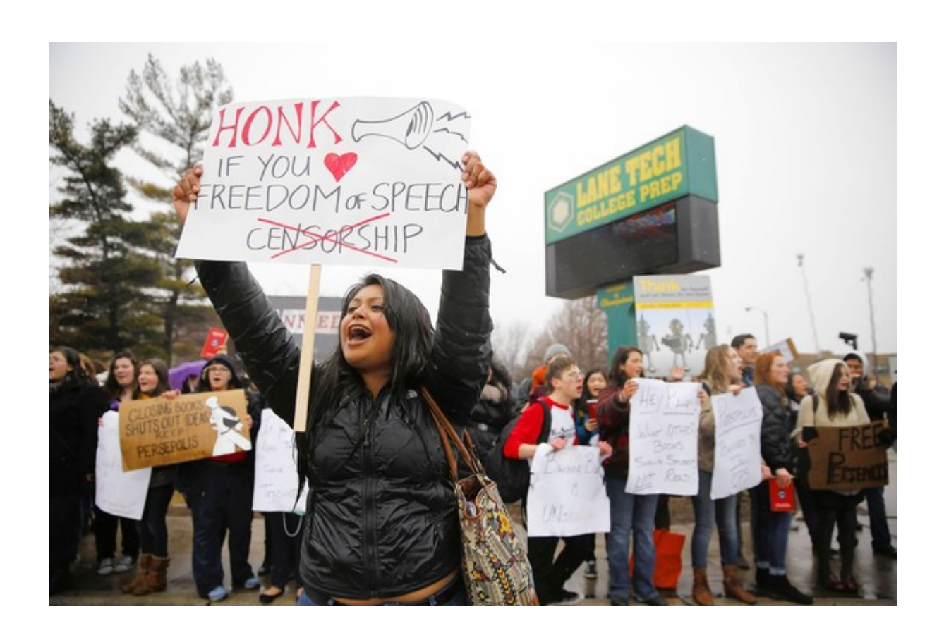
Blog of The National Coalition Against Censorship, March 18, 2018, <a href="https://ncacblog.wordpress.com/">https://ncacblog.wordpress.com/</a>