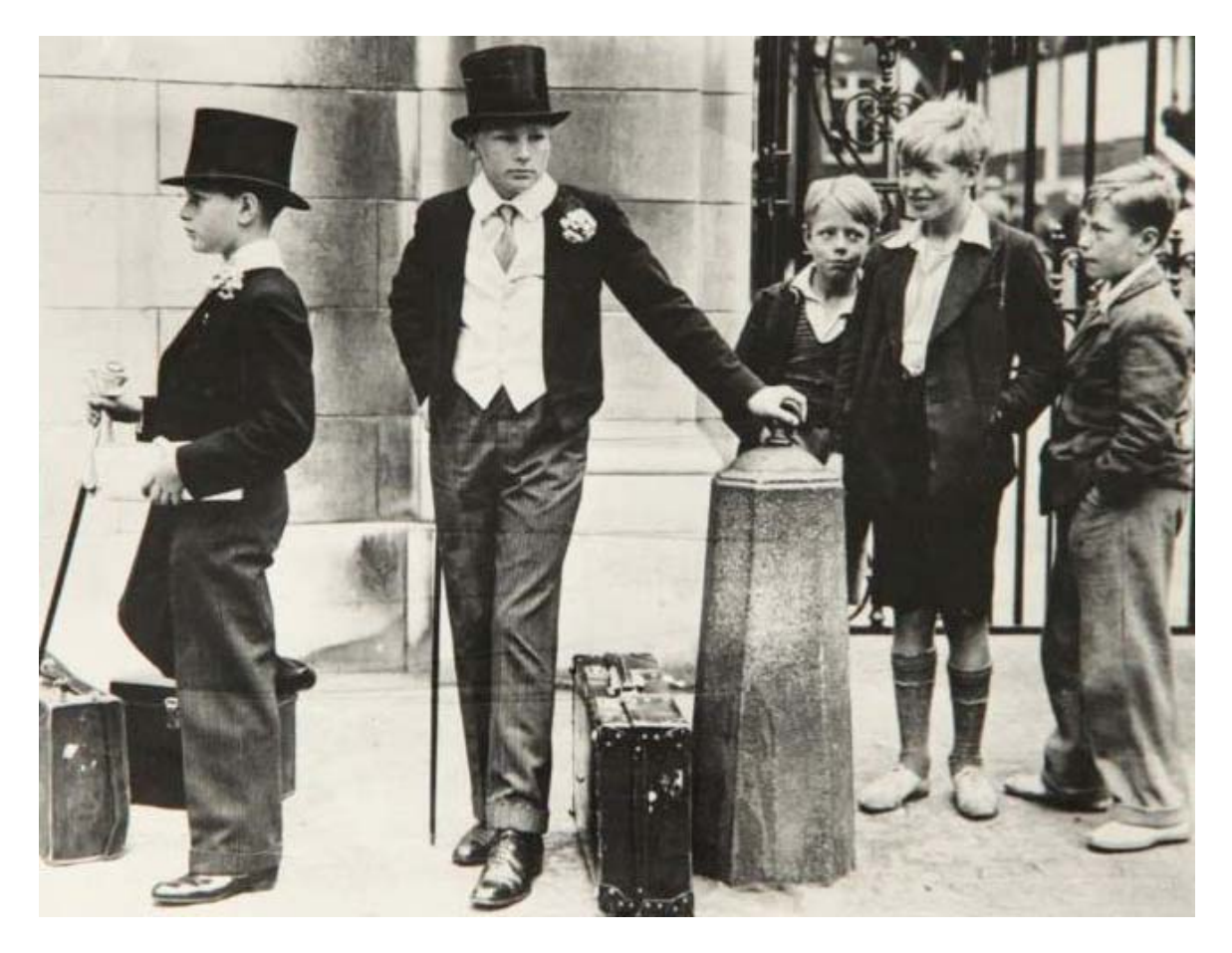
Jimmy SIME, untitled , 1937 (the photograph was taken in England).